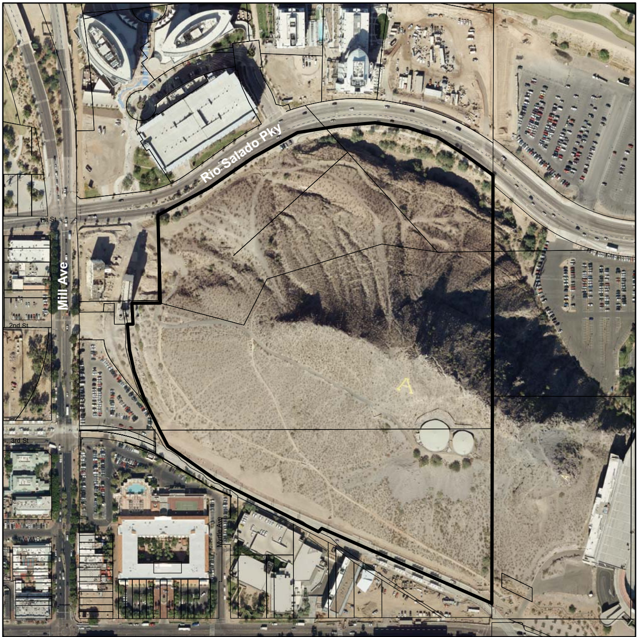
TEMPE (HAYDEN) BUTTE (PL080136)